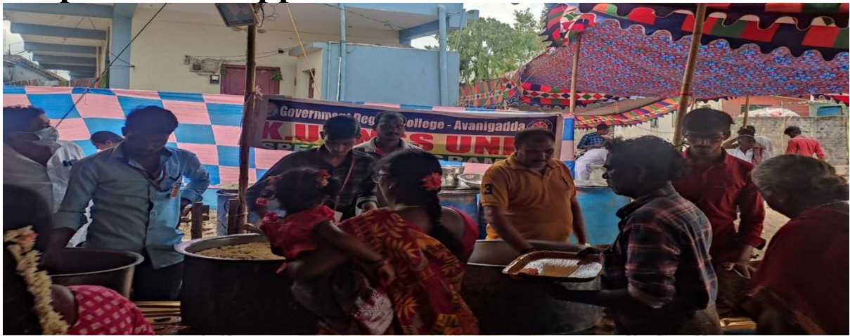
Help to serve food