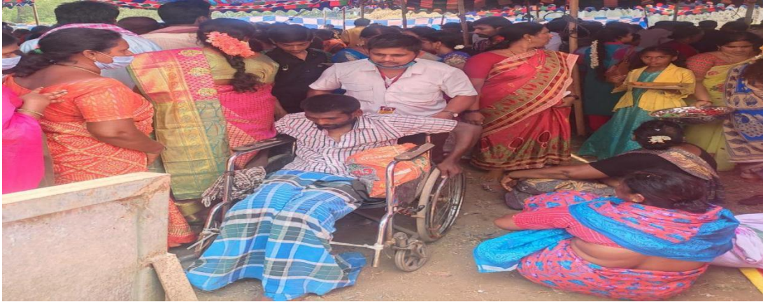
Help to handicapped devotees