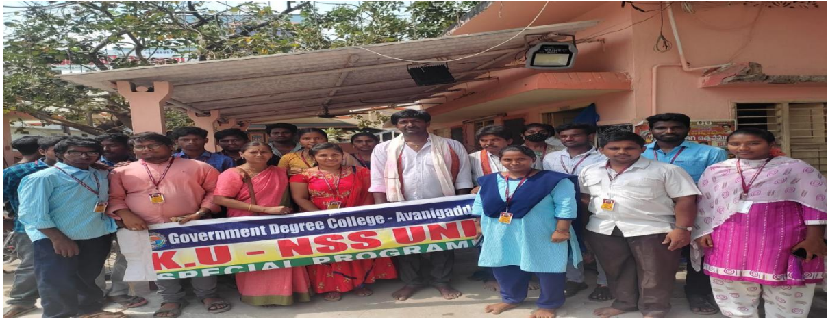
NSS volunteers with Temple chairman