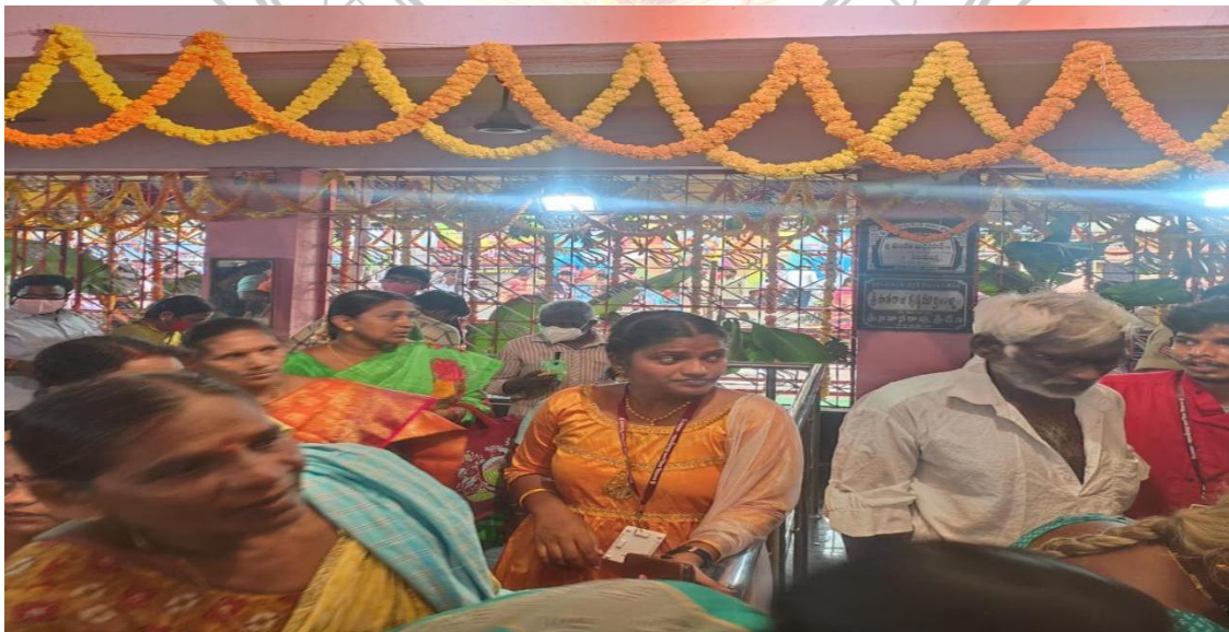
Help to control rush and maintain the Q-line