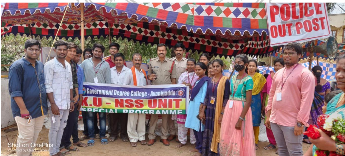
NSS volunteers with police Avanigadda